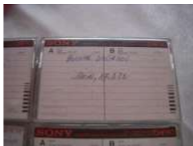
A audio archives

Part I: Contribution to Heritage Preservation by Cameroonian Witnesses to Colonial History throughout the Birth of Modern Cameroon 1884-1916 (Germany in Cameroon) and 1920-1930 (France and Great Britain in Cameroon)", 2015-2018