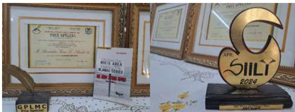
Prince Kum’a Ndumbe III, GPLMC 2022 Special Prize, and Edition AfricAvenir, Prize SIILY 2024