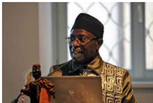
Vienna Symposium, African Testimonies and Oral Literature as Sources of Colonial History , October 21, 2015