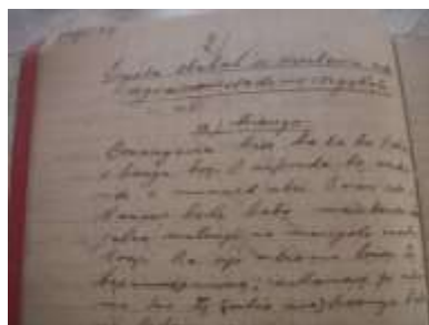
B old handwritten manuscripts