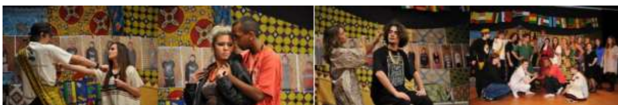
“Das Fest der Liebe – Die Chance der Jugend”, Theatre performance, BRG 6 Marchettigasse, Vienna, 2011