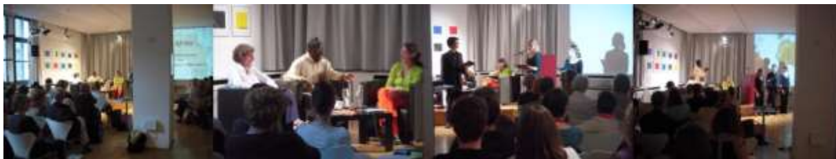
“Ach, Afrika ...”, Play reading from the plays of Kum’a Ndumbe III, Literaturhaus Stuttgart, 2009