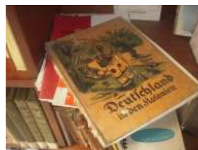
C 300 old books