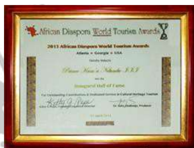
African Diaspora World Tourism Awards, Atlanta, Georgia, USA, inducts Prince Kum'a Ndumbe III into the Inaugural Hall of Fame for Outstanding Contributions & Dedicated Service in Cultural Heritage Tourism , 2013